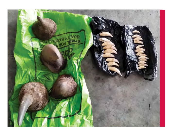
SINGAPORE, 2015: Rhino horns and tiger claws confiscated by authorities participating in Operation PAWS II, organized with assistance from Project Predator.

Conservation and habitat management are not enough to assure a future for wildlife threatened by demand for illegal wildlife products. A strong professional law enforcement response, with a clear focus on investigation of criminals and networks, is essential to ensuring the survival of endangered Asian wildlife species. INTERPOL's Project Predator, with the support of USAID, will continue to prioritize and facilitate efforts to dismantle transnational criminals and networks operating in Asia.