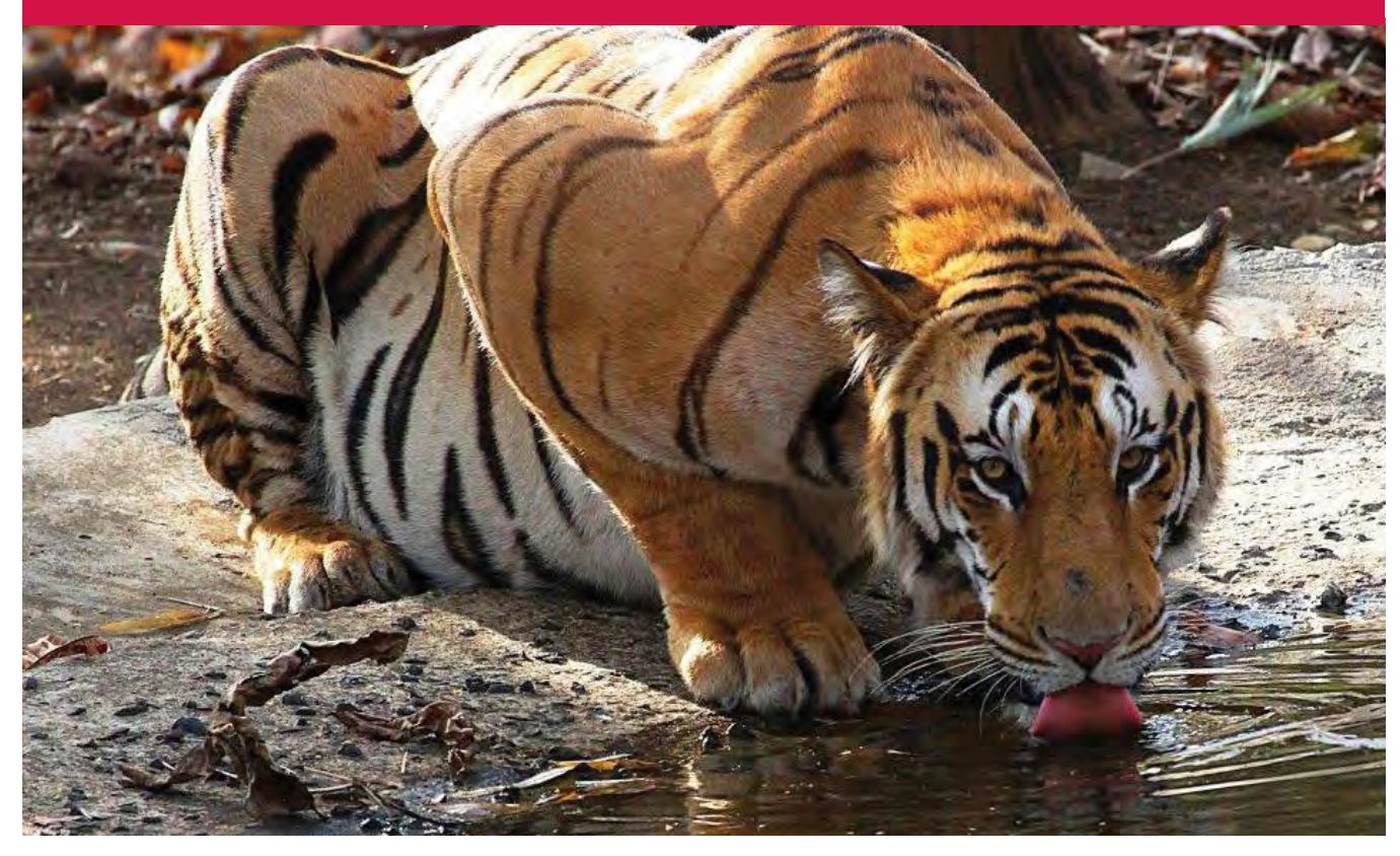
INDIA: Bengal tiger in the wild.