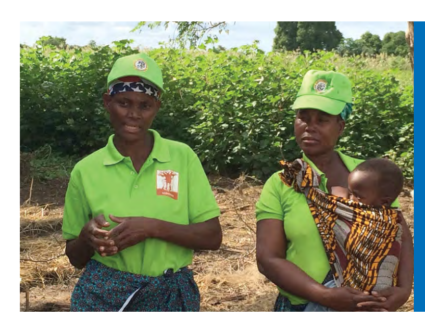
MOZAMBIQUE, 2016: As part of efforts to improve sustainability in communities around Gorongosa National Park, these "model moms" are helping young mothers grow kitchen gardens, prepare healthful meals, and understand the importance of good nutrition for brain and body development.

USAID's Biodiversity Policy recognizes both the intrinsic value of biodiversity and its importance to human well-being. USAID's integrated approach to biodiversity conservation meets complex problems with comprehensive solutions. Together with its partners, USAID gets to the root causes of multiple development challenges, and fosters solutions that benefit nations by building, not undermining, local rights and natural capital.