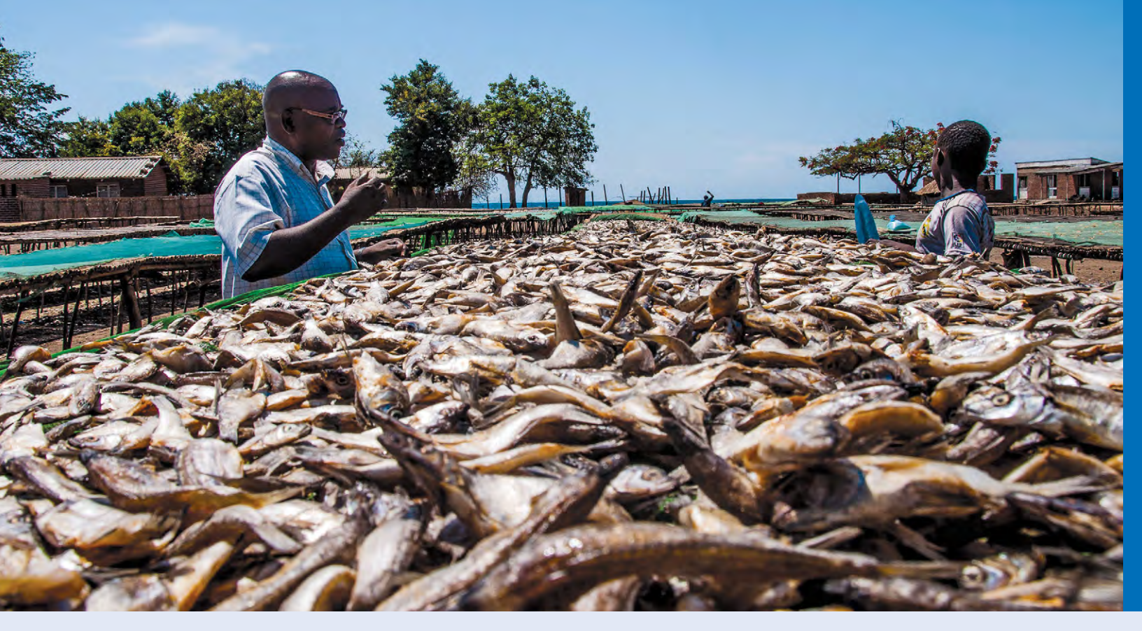
NEAR LAKE MALAWI, NOVEMBER 2015: Staff from USAID's fisheries conservation program advising local fishermen on how to reduce post-harvest losses.