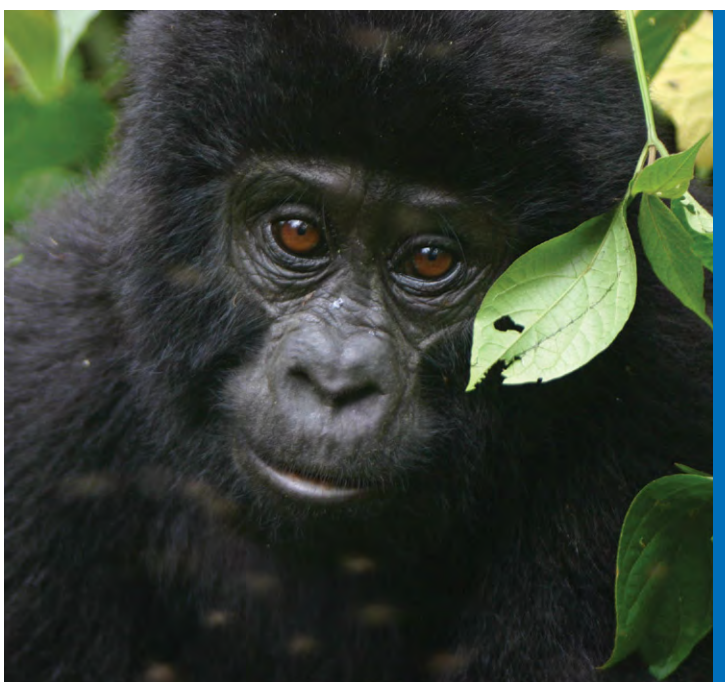
BWINDI IMPENETRABLE NATIONAL PARK, UGANDA, NOVEMBER 2004: Bwindi is home to nearly half of the world's gorilla population.